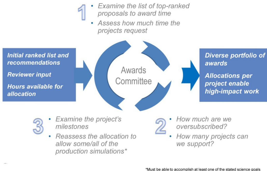
Figure 1. INCITE awards committee decision-making process.