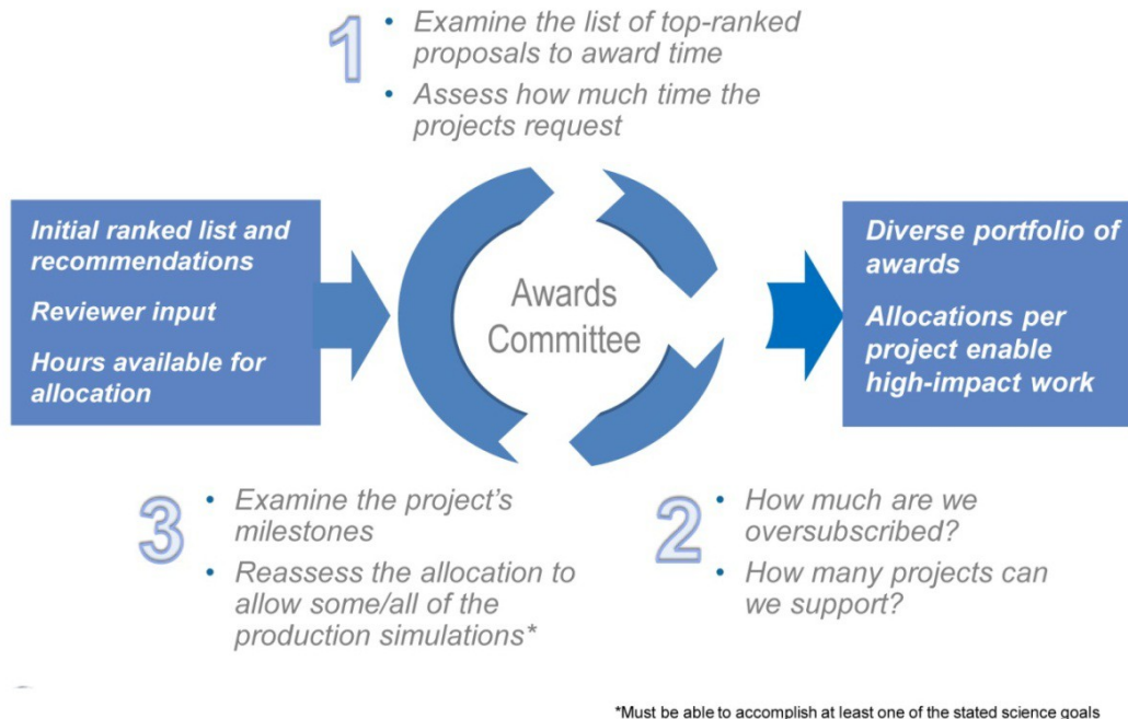
Figure 1. INCITE awards committee decision-making process.

When the centers are oversubscribed, each top-ranked project is assessed to determine the amount of time that may be awarded to allow the researchers to accomplish significant scientific goals. Reductions in the time requested may be made to optimize both the total number of projects awarded and the time provided to each. Historically, only the top one-quarter to one-third of new proposals receive INCITE awards.